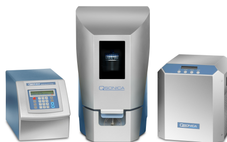
Figure 1: The Q800R2 Sonicator —The Q800R2 Sonicator (Qsonica LLC) demonstrates excellent DNA fragment size control and reproducibility for Illumina library preparation kits.

Four DNA sample replicates (QS1–QS4) were prepared from a human lymphocyte cell line (Coriell Institute for Medical Research, NA12878). To obtain 350 bp average insert sizes, DNA samples were sonicated in separate, generic, polypropylene tubes on the Q800R2 Sonicator (Qsonica, Model No. Q800R2) with identical instrument settings (Table 1). The white Qsonica tube holder was used (Qsonica, Part No. 4256), although several options are available for a variety of sample type and throughput needs (Table 4). Samples were quality checked for fragment size and fragment uniformity on the Fragment Analyzer (Advanced Analytical) using the High Sensitivity NGS Fragment Analysis Kit (Advanced Analytical Cat No. DNF-474). Four