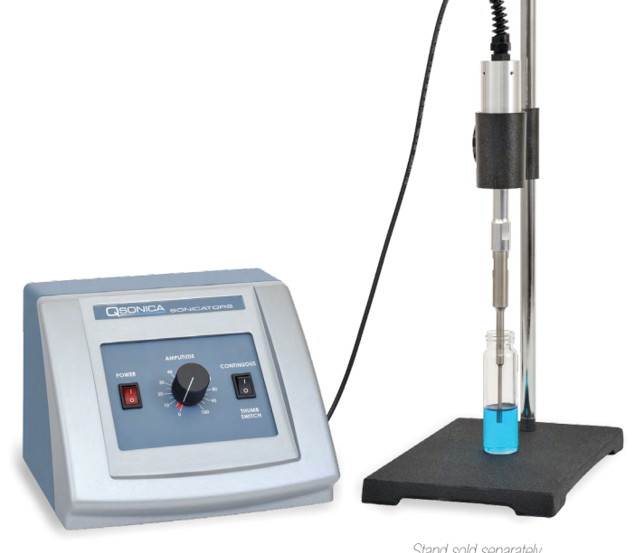
Stand sold separately.