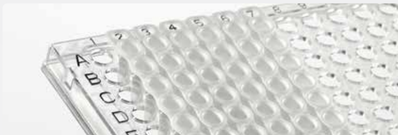
4ti-0950-F Vari-Strip™ 480/96 frame for Roche LightCycler 480