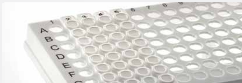
4ti-0757-F Universal fully skirted plate