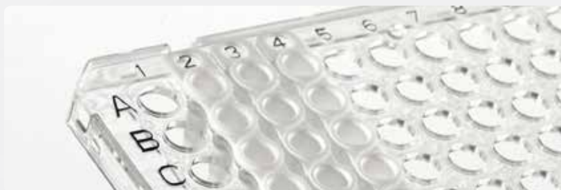
4ti-0910-F Vari-Strip™ FastBlock frame for ABI Fast Block